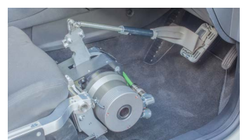
Rotary Brake Robot (RBR)

Rotary Brake Robots use compact rotary actuators which provide a very high apply rate. The RBR 1500 offers the highest performance of any AB Dynamics brake robot and is designed to give the combination of high force and rapid apply rate needed for Brake Assist System testing. The RBR 600 uses the same actuator as a CBAR 600 for moderate brake force testing.