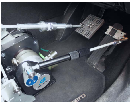
Combined Brake and Accelerator Robot (CBAR)