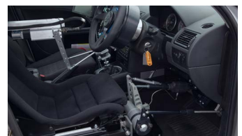
Clutch Robot (CR)

The Clutch Robot is available with the CBAR 600 or the CBAR 1000. It is used in conjunction with the Gearshift Robot to enable driverless testing in cars with manual gearboxes. Clutch engage/declutch profiles can be defined to suit the test vehicle.