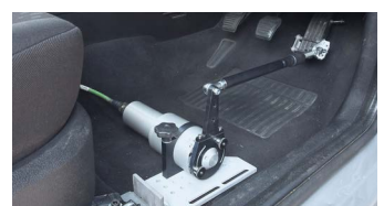
Accelerator Robot (AR)

The Accelerator Robot (AR 1) uses a compact rotary actuator to control throttle pedal position. It gives accurate speed control for constant speed/acceleration, and can also be used for control of throttle pedal position.